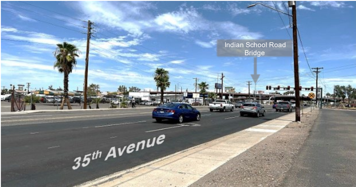
Viewpoint south of Indian School Road along 35th Avenue, looking north along 35th Avenue at the existing Indian School Road bridge. Photo taken near 3839 N 35th Ave, Phoenix, AZ 85017.