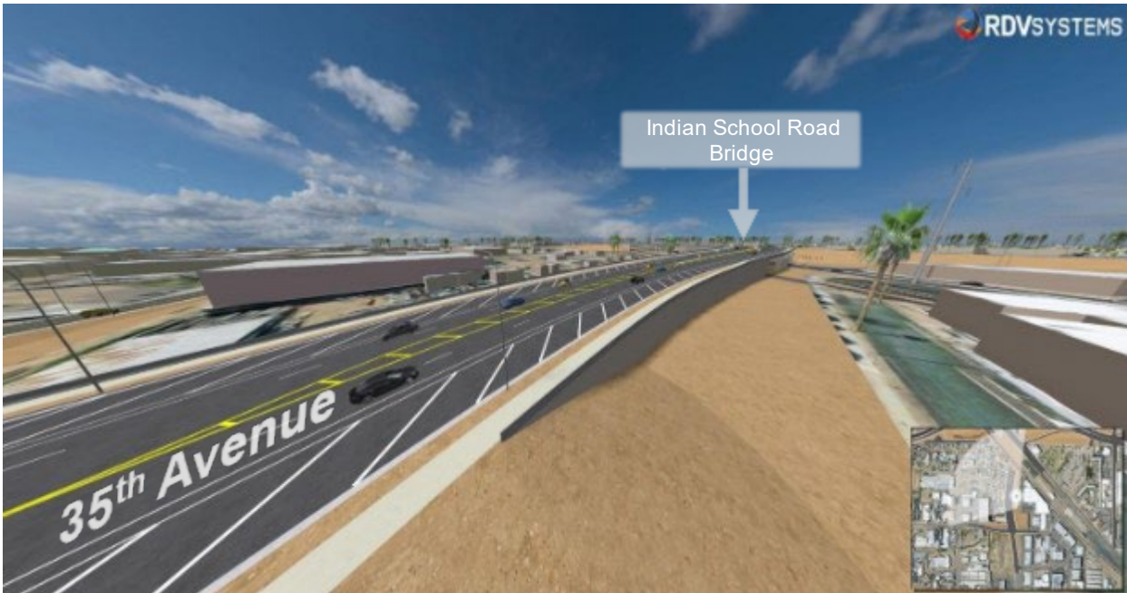
Viewpoint south of Indian School Road along 35th Avenue, looking north along 35th Avenue at the proposed Indian School Road/35th Avenue elevated intersection.